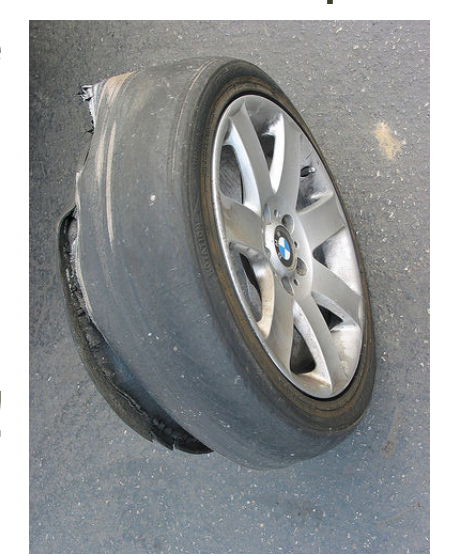
Worn tread = poor grip

Would you use a bald tyre? There is a legal minimum depth requirement on a Tyre, footwear is discretionary!